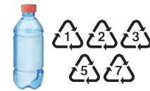
PLASTICS Label #s 1, 2, 3, 5 & 7