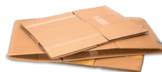
DRY, UNWAXED CARDBOARD (FLATTENED)