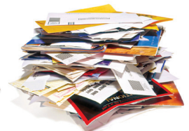
MIXED PAPER (MUST BE DRY)