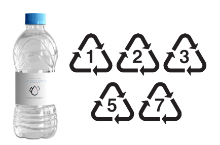
PLASTIC (Clear or Colored*)

NOTE: Items must be clean, with non-paper items rinsed and labels removed.