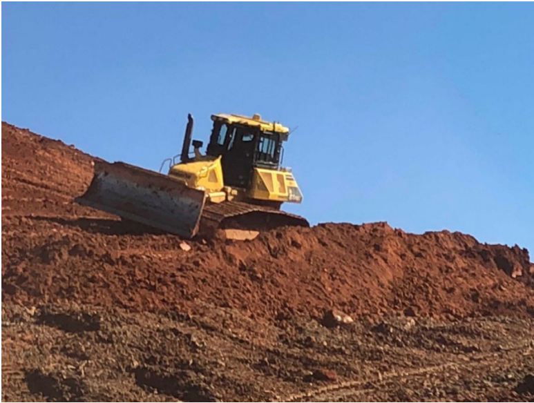
PHOTO IMAGE 3 – Meridian Waste landfill heavy equipment operations.