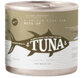
ALUMINUM and STEEL CANS