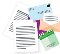
MIXED PAPER *NO Shredded paper

ONLY these items should be in your recycling cart: