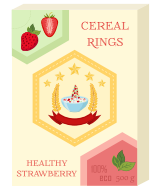
FIBERBOARD & CARTONS